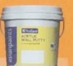
ASIAN PAINTS ACRYLIC WALL PUTTY