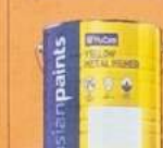
ASIAN PAINTS TRUCARE YELLOW METAL PRIMER