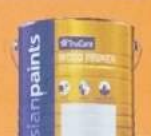
ASIAN PAINTS TRUCARE WOOD PRIMER