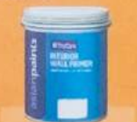
ASIAN PAINTS TRUCARE INTERIOR WALL PRIMER (WT)