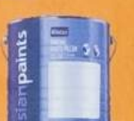
ASIAN PAINTS KNIFING PASTE FILLER

For more information on painting and colour selection, log on to www.asianpaints.com or call us at 18002095678