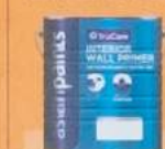
ASIAN PAINTS TRUCARE INTERIOR WALL PRIMER (ST)