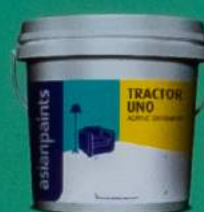
TRACTOR UNO ACRYLIC DISTEMPER